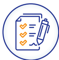
Annual Community satisfaction survey

In addition to informal engagement opportunities as part of the Shire's day-to-day activities, the Council will use a range of techniques and opportunities to engage with our Community.