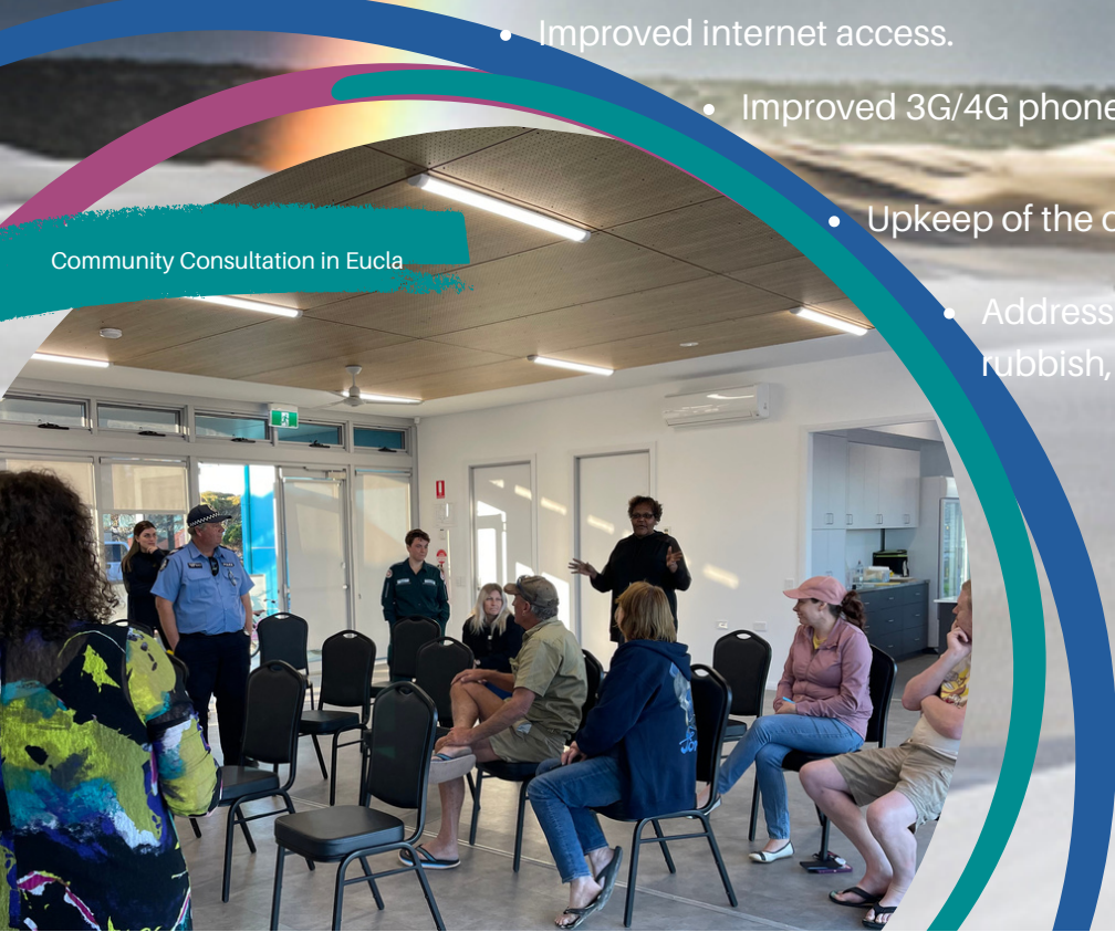
Community Consultation in Eucla