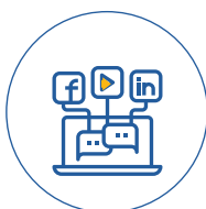
Sharing information via Shire's digital platforms