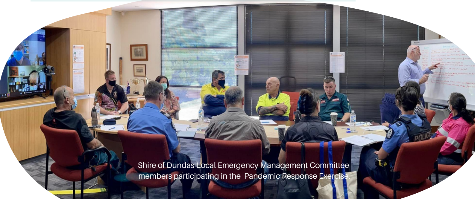
Shire of Dundas Local Emergency Management Committee members participating in the Pandemic Response Exercise.