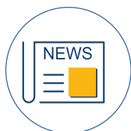
Monthly Shire News Norseman Today Newspaper