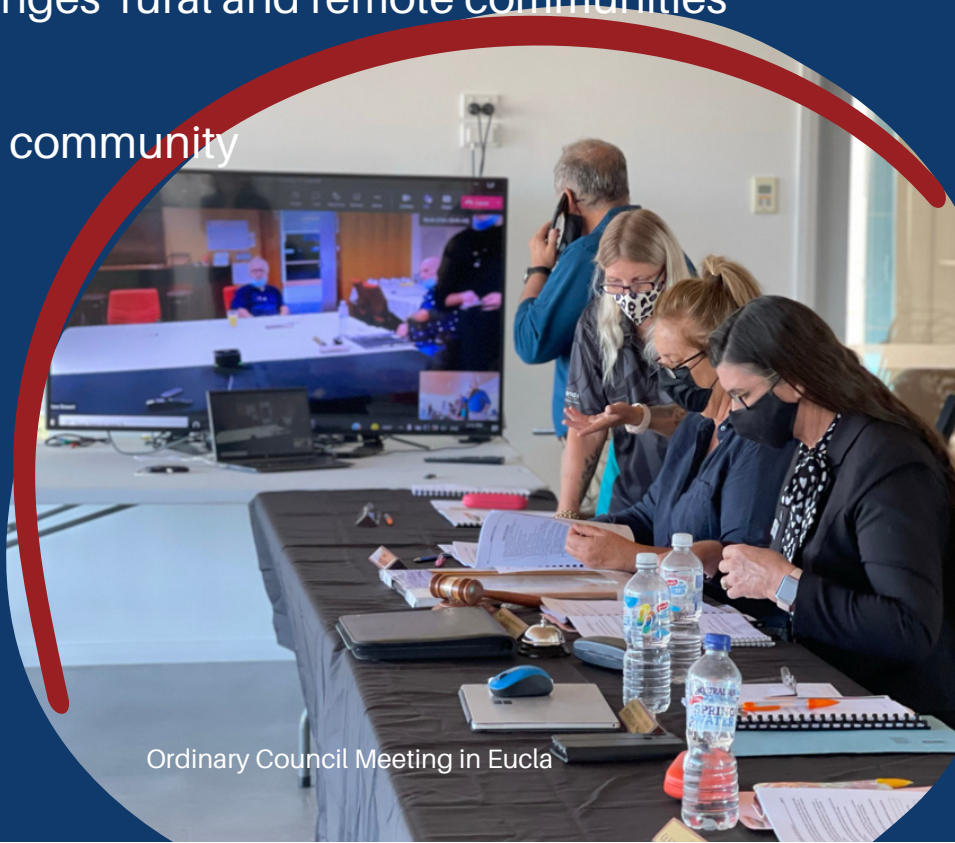
Ordinary Council Meeting in Eucla