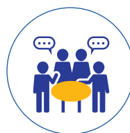
Focus groups & workshops